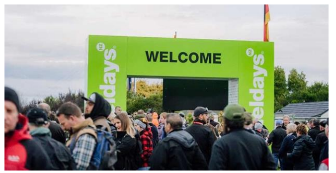
entrance gate. The food was good as there were a few food courts.

On Thursday 17th of June, some of our fellow Rangipō and Kārangaranga students had the opportunity to go to Mystery Creek, Hamilton to decide their future career pathways within agriculture (farming). The day was rainy, and it was packed with people. The bus that the students were on were able to drive in the fast lane and were dropped off directly in front of the