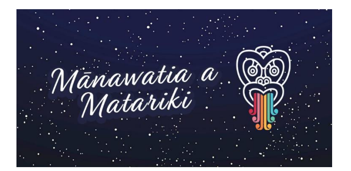
Tera a Matariki ka rewa ake ki te poho o Ranginui nau mai haere mai nga hua o te tau hou. Matariki tapuapua, Matariki nana i ao ake te kai ki runga.

Kia tipu matomato mo nga ra kei tua, hiia ake nga tini a Ikatere ko Waiti, ko Waita, Waipuna ana te whenua i nga roimata o Rangi hei oranga mo te whenua, hei oranga mo te wairua.