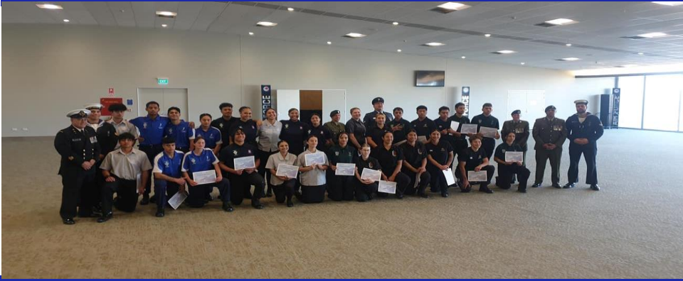
Service Academy at the Leadership camp in Ohakea