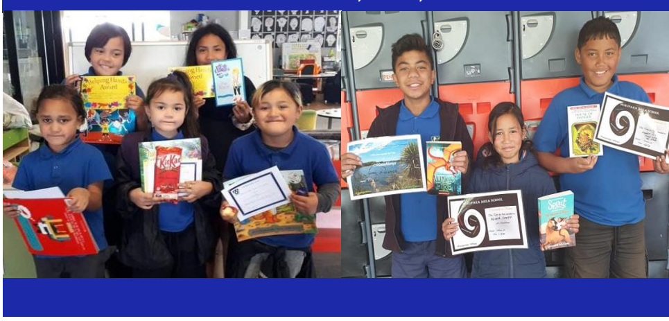
Newsletter: Week 6, Term 4, 2020