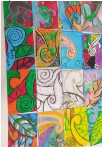
Elements of Colour Y5/6