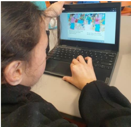
Above- Daily reading journals and online reading.